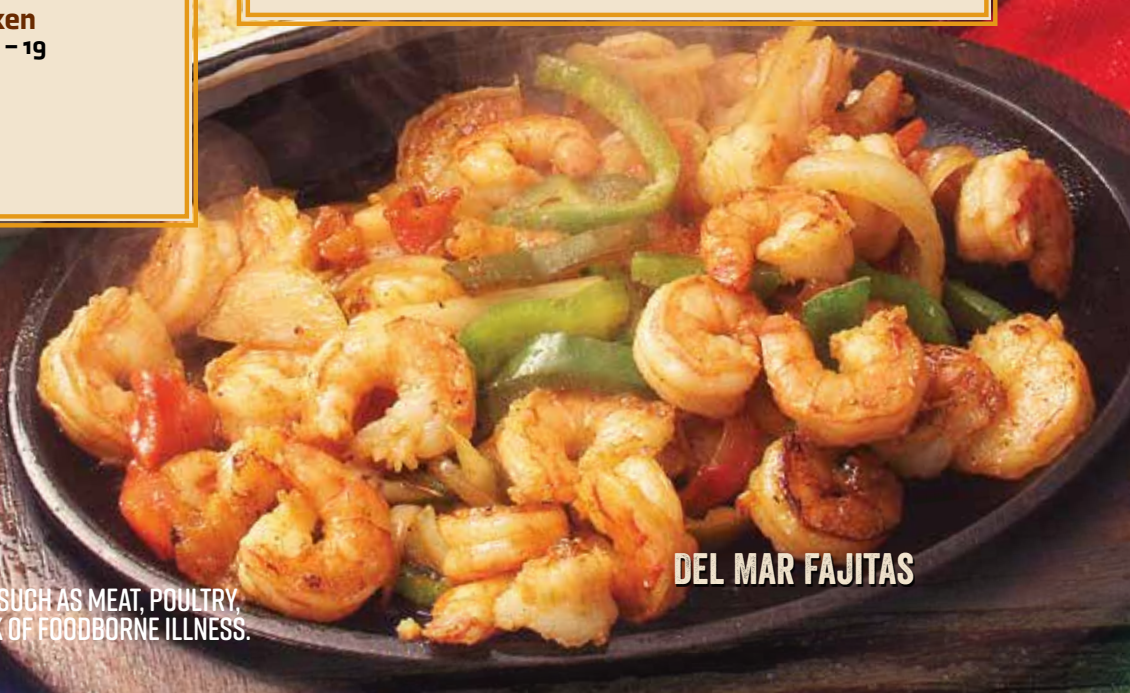
DEL MAR FAJITAS

PORK CARNITAS Tender slow-cooked pork served with rice, beans and tortillas. Salad includes lettuce, avocado, tomatoes, onions, bell peppers, jalapeño and lime - 14.50