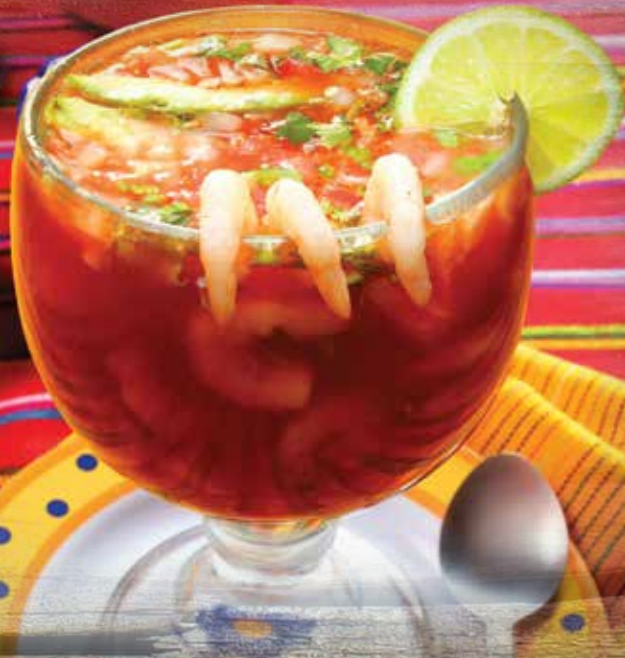
CÓCTEL DE CAMARÓN